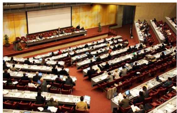
COP-4 of the Stockholm Convention, May 2009

For further information please visit COP-5 webpage: www.pops.int .