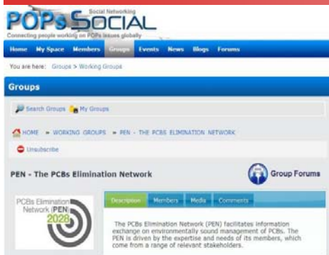
POPs Social Networking webpage

The end of the year 2010 was particularly exciting for members of the PCBs Elimination Network (PEN).