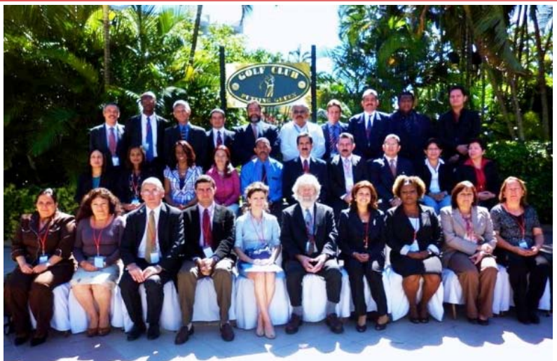
Workshop participants in El Salvador

Two additional regional synergies workshops will be held in 2011. Dates and venue will be advertised soon.