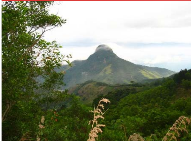
View in Sri Lanka

The Secretariats of the Stockholm Convention on Persistent Organic Pollutants and of the Rotterdam Convention on the Prior Informed Consent Procedure for Certain