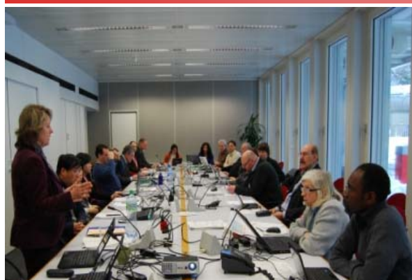
Experts attending the meeting in Geneva

The fifth expert meeting to further develop the Standardized Toolkit for Identification and Quantification of Dioxin and Furan Releases was held in Geneva, Switzerland, from 1 to 3 December 2010.