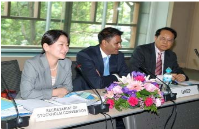
Opening ceremony of the regional workshop on new POPs in Asia

The regional workshop on new POPs, the process for reviewing and updating National Implementation Plans (NIPs) and reporting requirements under the Stockholm Convention for Asia was held on 23-26 November in Bangkok, Thailand. It was attended by representatives from 14 Parties, non-governmental organisations, as well as other relevant stakeholders. The workshop was organised in collaboration with the UNEP Regional Office for Asia and the Pacific.