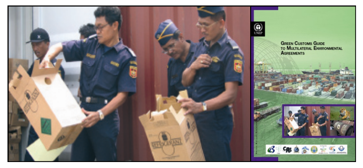
Green Customs Guide to Multilateral Environmental Agreements

The Basel Convention Regional Centre for the Central America Sub-region including Mexico in El Salvador will be representing the Secretariat of the Basel, Rotterdam and Stockholm conventions during a forthcoming sub-regional Green Customs Initiative (GCI) workshop in Merida, Yucatan, Mexico on March 6. to 8. 2012. The Secretariat of the Environment and Natural Resources of Mexico, UNEP Division of Technology, Industry and Economics (DTIE) and the National Ozone Office are hosting the workshop. Following a train-the-trainers approach, the workshop will invite senior trainers of national customs schools from Mexico, Guatemala, Belize, Brazil and Venezuela and from regional training institutes.