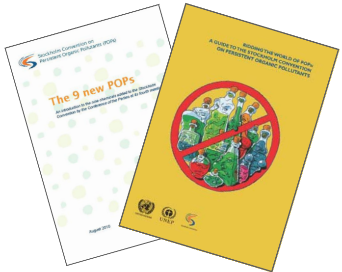
Two Convention booklets on POPs: The 9 new POPs (left) and, Ridding the World of POPs: A Guide to the Stockholm Convention on Persistent Organic Pollutants (right)

With regards to Annex B POPs, the convention currently contains DDT, allowed for disease vector control in accordance with WHO guidelines. In 2009, the global production of DDT was estimated at 3,314 tons, which represent a reduction of 43% compared to the 2007 level. Annex B also contains the newly added industrial chemical perfluorooctane sulfonic acid (PFOS). Seven countries have so far registered for PFOS production/use. A process for reporting on elimination and for evaluating the continued need of PFOS will be considered at the next Conference of the Parties.