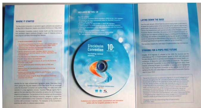
The 10th anniversary package

For more information regarding the 10 th anniversary activities, please contact: sc10@pops.int .